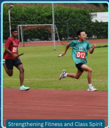
Strengthening Fitness and Class Spirit through Active Participating during Annual Sports Day