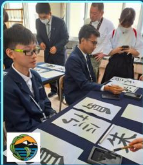
Calligraphy Demonstration Facilitated by Omachi High School Students