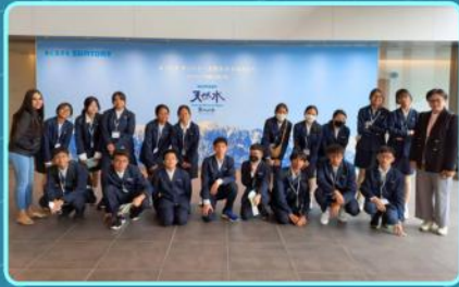
Visit to the Suntory Water Plant in Nagano, Japan