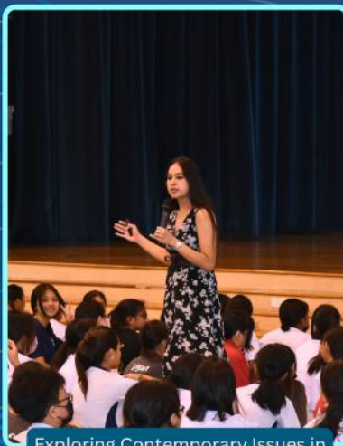
Exploring Contemporary Issues in Greater Depth during School Assembly