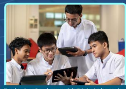
Equipping Students with Digital Literacies to enable them to be Discerning and Responsible users of ICT