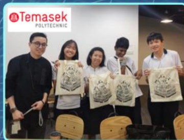
Attachment at Temasek Polytechnic School of Design, Media Marketing