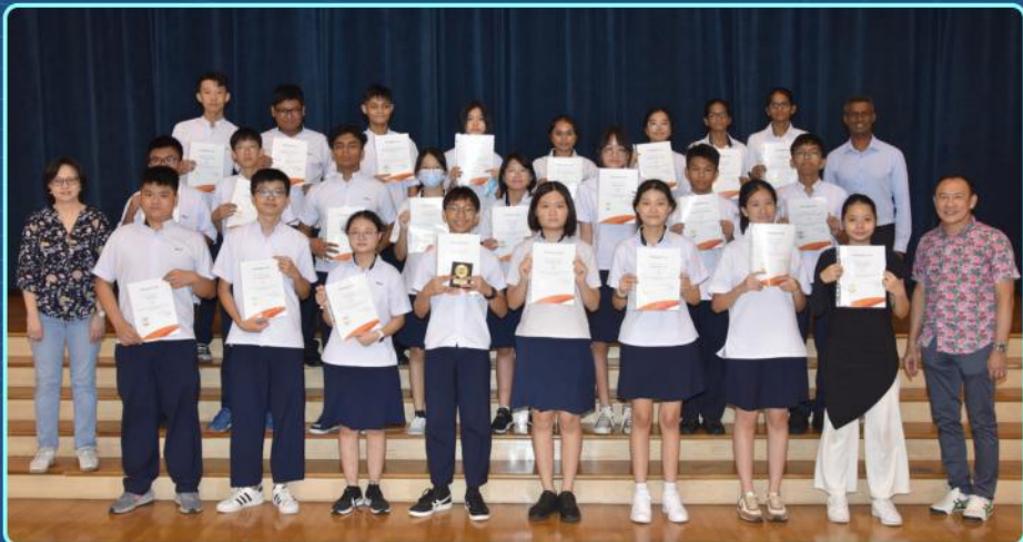
Recognising our Outstanding Students on the Principal's List, the Highest Academic Accolade in the school.