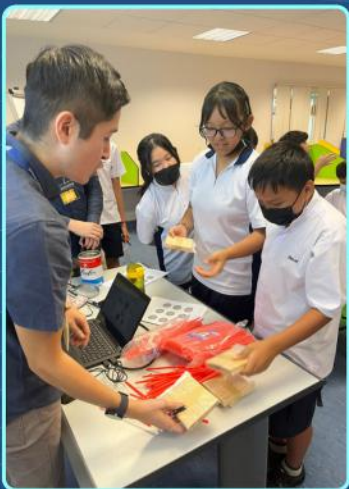
Engaging in Inquiry-based Math Research