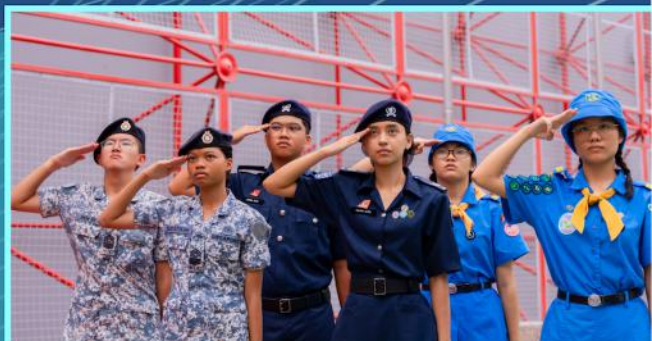
Uniformed Groups: NPCC | NCC (SEA) | Girl Guides