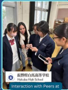
長野県白馬高等学校 Hakuba High School