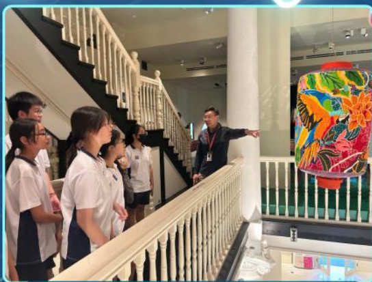
Fostering Civic Engagement, Global Awareness, and Cross-Cultural Sensitivities among our Students