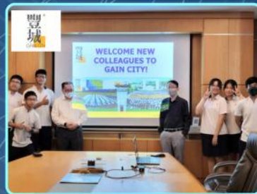
Attachment at Gain City, User Experience (UXP)