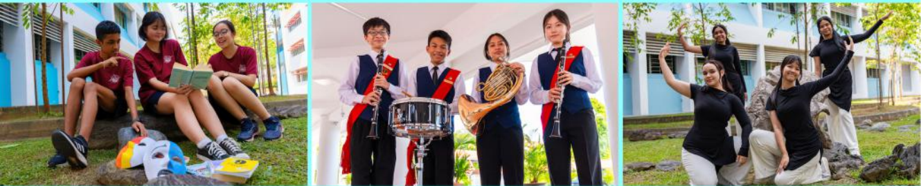
Performing Arts: Drama | Band | Modern Dance