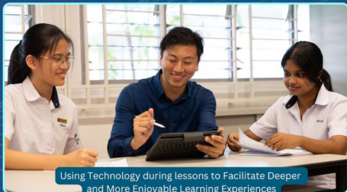
Using Technology during lessons to Facilitate Deeper and More Enjoyable Learning Experiences

Teaching and Learning in PCSS aims to ignite the passion for learning in our students by fostering students' intrinsic motivation to be self-directed and enjoy the learning process. Engaging learning experiences, both in and out of the classroom, highly customised for the various subjects, equip our students with not just knowledge but also 21st century competencies to be future ready learners.