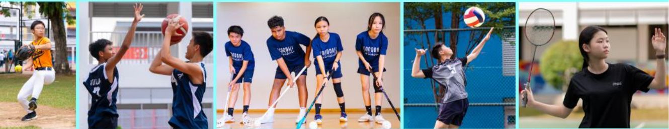
Sports: Softball | Basketball | Floorball | Volleyball | Badminton

With a variety of vibrant Co-Curricular Activities (CCAs) in the Sports, Uniformed Groups, Performing Arts as well as Clubs and Societies, students in PCSS are developed holistically with numerous opportunities to pursue their passion and talents whilst honing their skills in decision making, adaptability and ability to work in teams towards common goals.