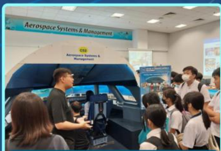
Exploring and Deepening Knowledge of Post Secondary Pathways and Options through various Education and Career Guidance Programmes