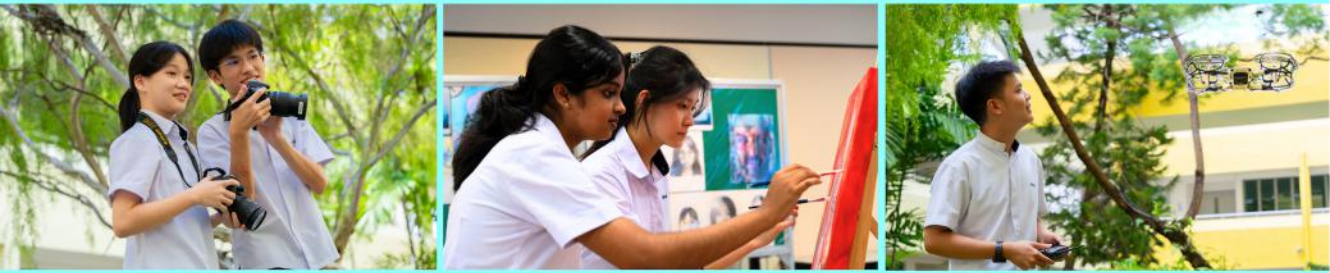
Clubs & Societies: Infocomm Club | Art Club | Aeromodelling