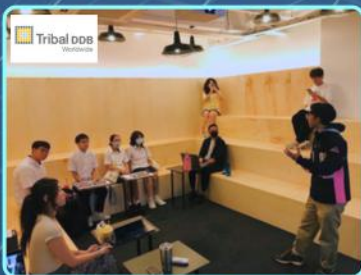
Attachment at Tribal Worldwide Singapore, Media Marketing