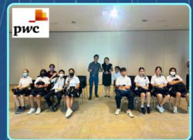
Attachment at Price Waterhouse Cooper, Accountancy