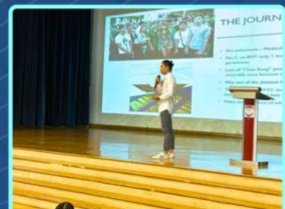
Strengthening Rootedness to Singapore through National Service Talk by the Alumni