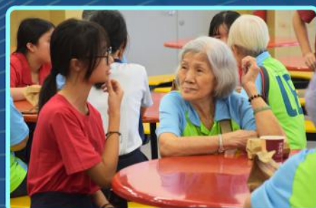
Understanding and Serving the Needs of the Community by Engaging the Elderly