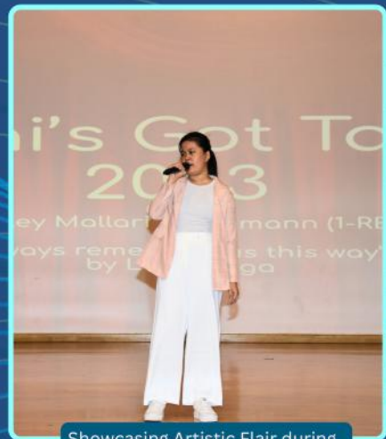
Showcasing Artistic Flair during Peicai's Got Talent