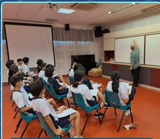
Honing Communication and Presentation Skills during English Public Speaking Workshops