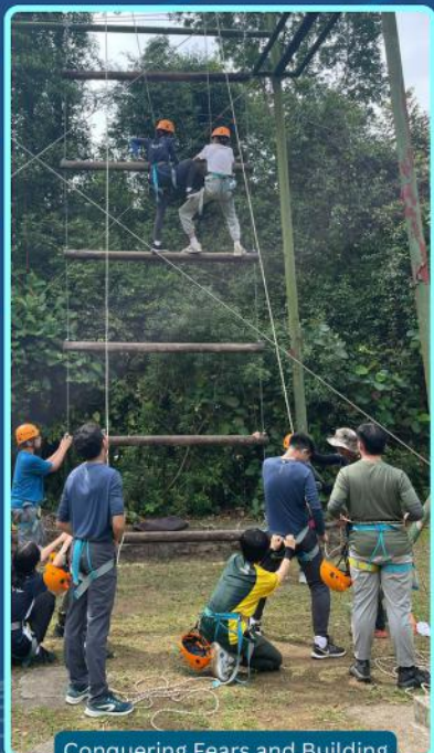
Conquering Fears and Building Resilience through Team Building Activities at Outward Bound Singapore

The wide variety of exciting Character and Citizenship Education (CCE) opportunities in PCSS nurture critical 21st Century Competencies (21CC) such as collaboration and communication skills as well as develop values for the future such as strength of character, resilience and a sense of belonging and pride in Singapore. These skills and values complemented by a good understanding of local and global contemporary issues enable our students to thrive in a more complex and volatile future.