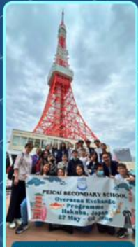
Visiting Tokyo Tower

The OSEP is part of the school's internalisation efforts to deepen the 21st Century Competencies (21CC) of global awareness and cross-cultural skills and sensitivities while strengthening our students' commitment and rootedness to Singapore. Beyond interaction with their counterparts in schools, the trip also include visits to relevant industries and organisations.