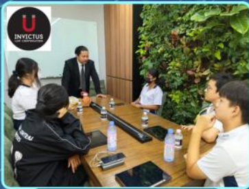
Attachment at Invictus Law Corporation, Legal Services

As the school's flagship Education Career Guidance (ECG) programme, Peicai's SWAP provides opportunities for students to gain knowledge and valuable insights into the world of work via attachment to different companies and organisations. Sectors involved include Law, Finance, Business, Design and Science amongst many others.